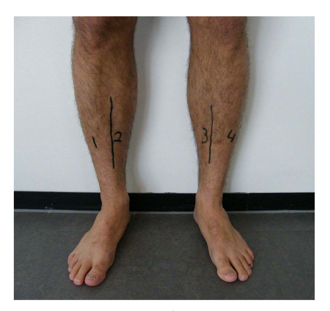
Figure 1 The Running Leg Pain Profile (RLPP): 1. lateral side right leg; 2. medial tibial border right leg; 3. medial tibial border left leg; 4. lateral side left leg (calves, region 5 and 6, optional).

To diagnose ERLP correctly, it is necessary to provoke the complaints with an exercise test and repeat the physical examination immediately after exercise.<sup>76</sup> <sup>80–84</sup> In the Dutch armed forces the ' Running Leg Pain Profile ' (RLPP) has been developed as a diagnostic tool for ERLP.<sup>80</sup> During a standardised treadmill test (increasing speed and incline) performed in running shoes, a patient is asked to give a pain score of 1–10 for four (or six) regions of their legs (anterior compartment and medial tibial border for both right and left legs and the calves are the two additional two regions) (Figure 1). The test contains running and marching and is designed to reproduce symptoms in the military patient group. CECS symptoms may be reproduced best