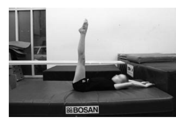
Figure 4 test item 5, semi pike ups start