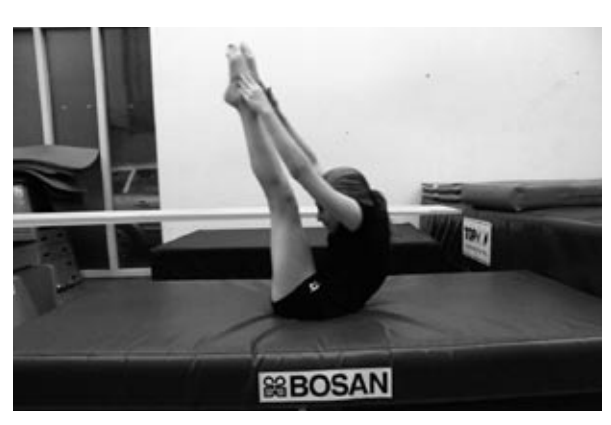
Figure 5 test item 5, semi pike ups middle position