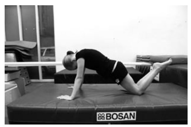
Figure 3 test item 4, push ups middle position