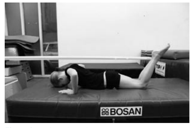
Figure 2 test item 4, push ups start