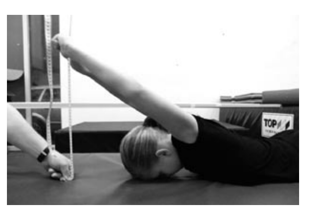
Figure 9 test item 8, shoulder flexibility (prone).