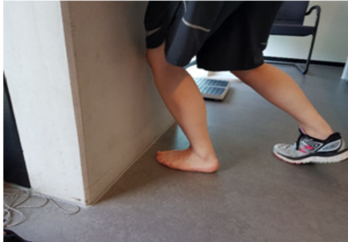
Appendix, Fig B: Soleus stretch (left leg, barefoot), criterion for normal value = minimal distance 5 cm from the wall or more.

Citation: Wes O. Zimmermann, C.W. Linschoten, A.I. Beutler, E.W.P. Bakker. The Immediate Effect of Extracorporeal Shockwave Therapy for Chronic Medial Tibial Stress Syndrome. Archives of Physical Health and Sports Medicine. 2019 2(1): 20-28.