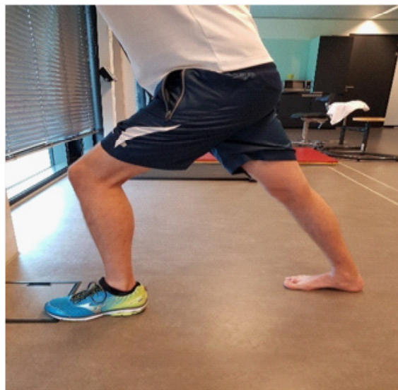
Appendix, Fig A: Gastrocnemius / Achilles stretch (right leg, barefoot), criterion for normal value = maximal angle compared to a vertical line: 70 degrees or less.